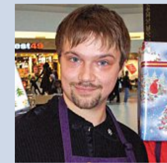
"Christmas is stressful enough for most people, everyone appreciates helping hands around the holidays; I'm just glad to be out doing my part, and epilepsy awareness is a great cause."